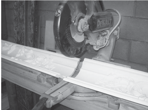
Step 1. Cut Moulding in half.