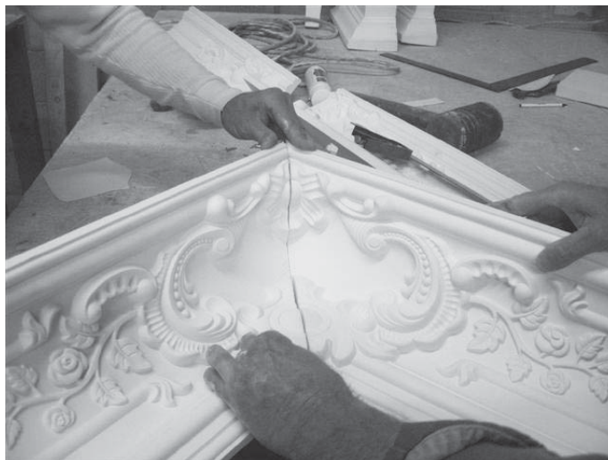
Step 5. Fine sand the cut edges and assemble.