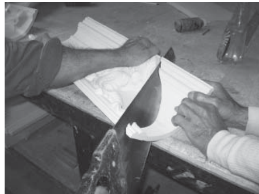
Step 3. & 4. Using either a compound miter box or hand saw, cut each piece at 45 degree angle using the molded tab as a guide.